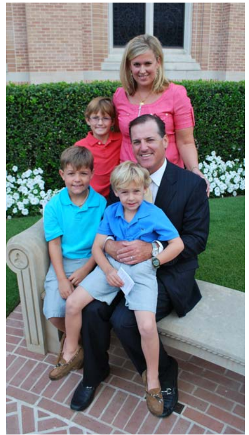
Easter Day — April 24, 2011