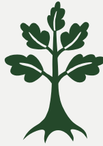
The Giving Tree