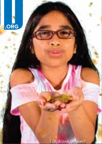
End Blood is Great

Scan QR code to schedule your next appointment or visit bit.ly/smeclblooddrive