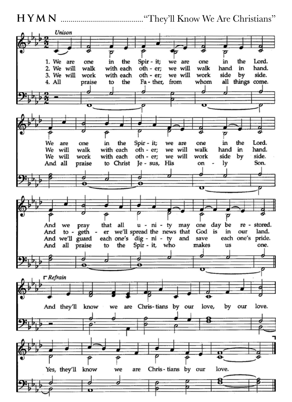
Music and Text: Peter Scholtes; based on John 13:35; © 1966 by F.E.L. Publications. All rights reserved. Used by permission. CCLI #805314.