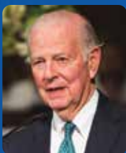
The Honorable James A. Baker, III 61st Secretary of State