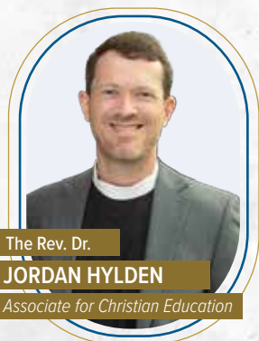
The Rev. Dr.

7–8:30 p.m. • Walking Stick Brewery Co. 957 Wakefield Dr.