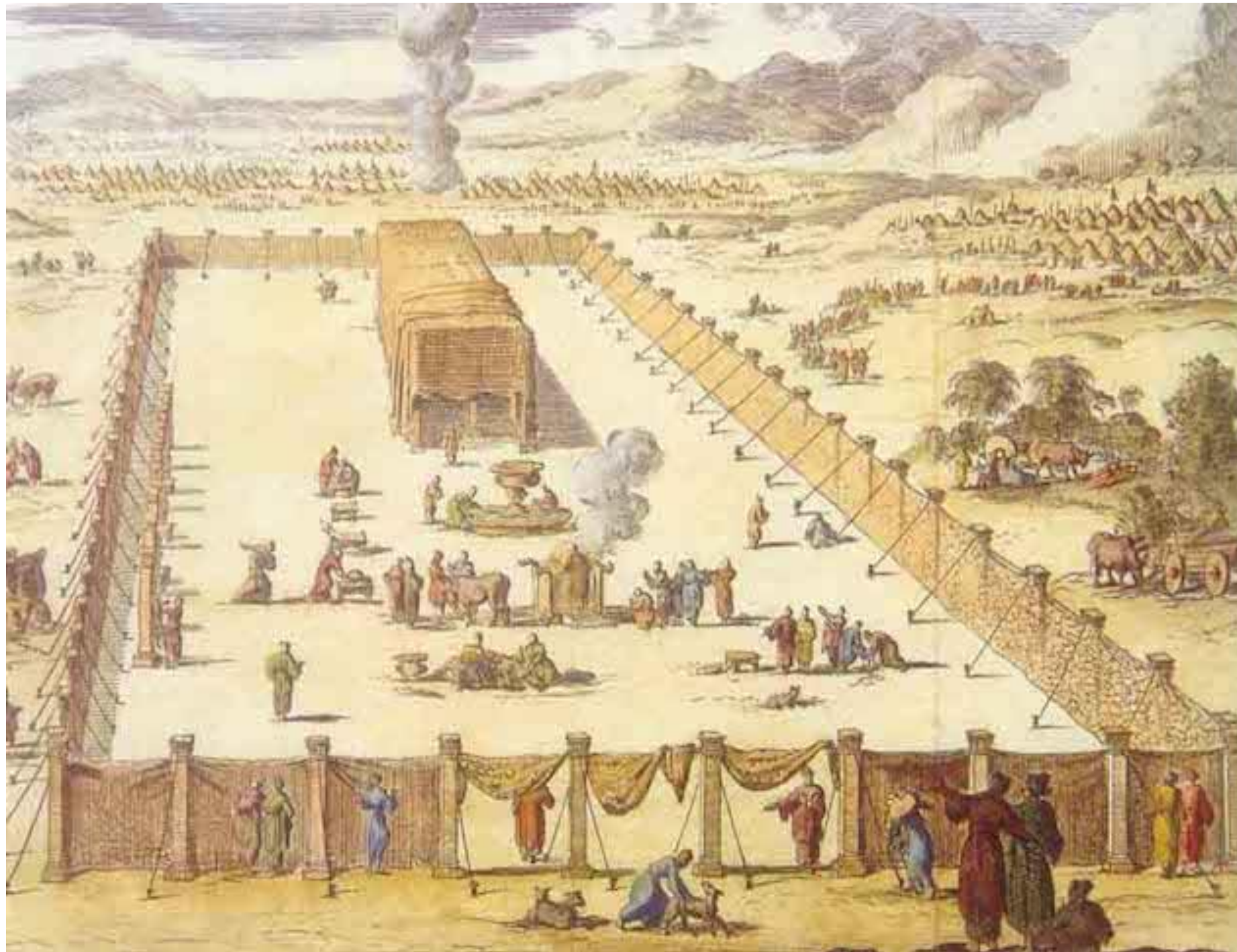
Public domain illustration from MyJewishLearning.org