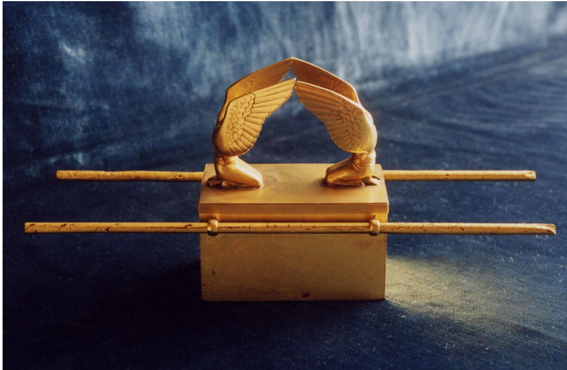
Scale model of Ark of the Covenant Glencairn Museum

The Ark of the Covenant was situated in the Tabernacle's Holy of Holies