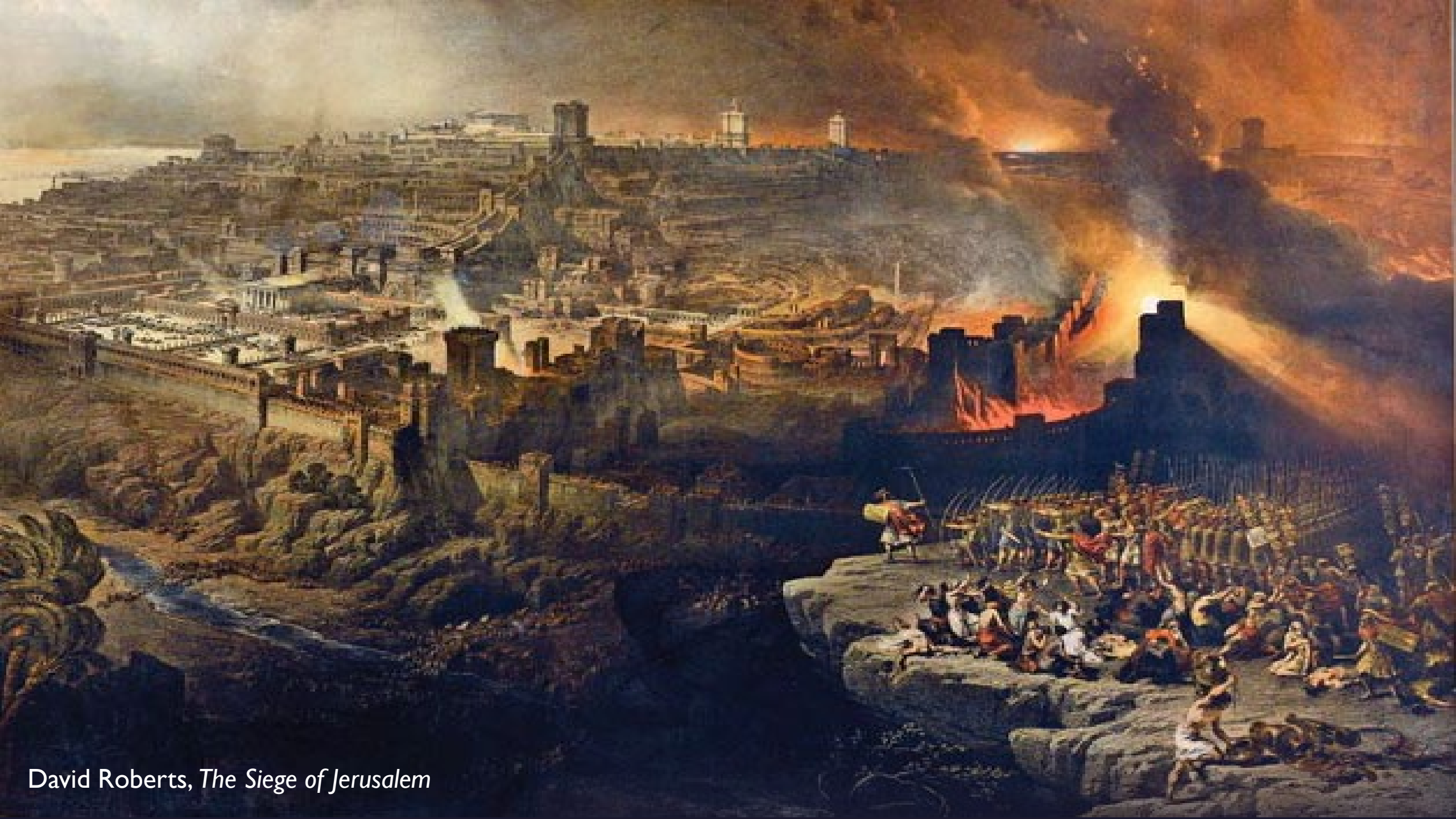
David Roberts, The Siege of Jerusalem